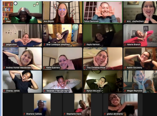
2021-2022 DEL Teacher Certificate program Cohort