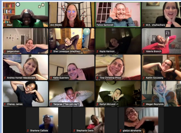
2021-2022 DEL Teacher Certificate program Cohort